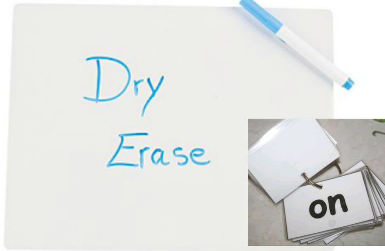
Write words on a dry erase board.