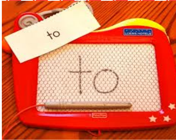
Write words on a magna doodle.